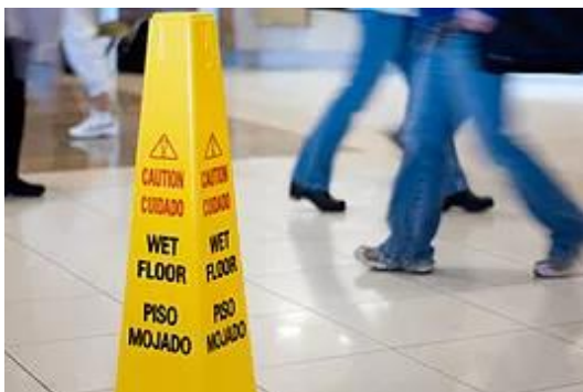
Universal Safety Practices