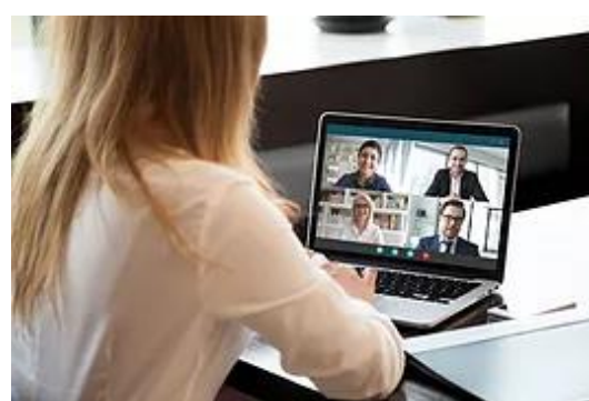
Virtual Team Building and Management