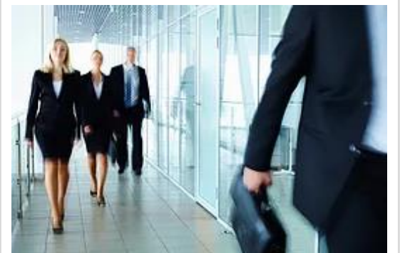
Employee Termination Process