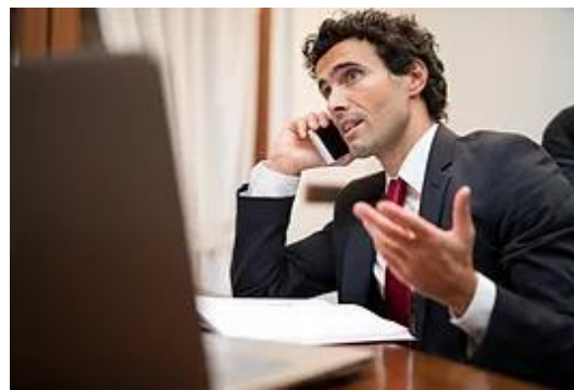
Prospecting and Lead Generation