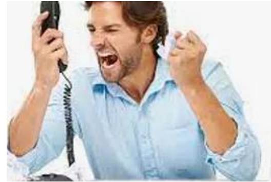
Handling a Difficult Customer