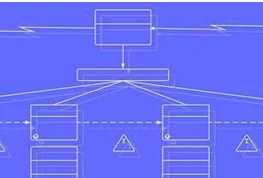
Lean Process and Six Sigma