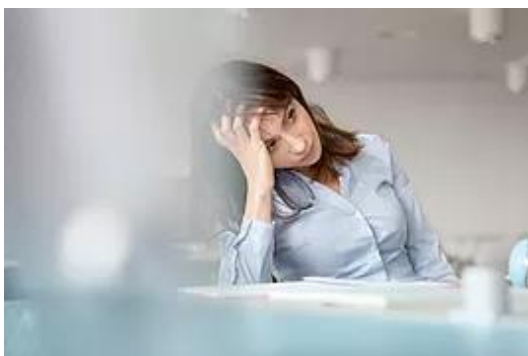
Managing Workplace Anxiety