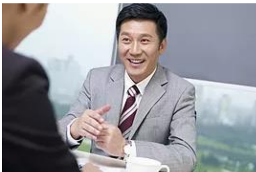
Increasing Your Happiness