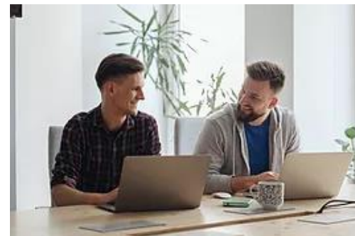
Collaborative Business Writing