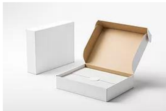
Creativity: Thinking Outside the Box