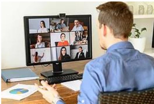
High Performance Teams; Remote Workforce