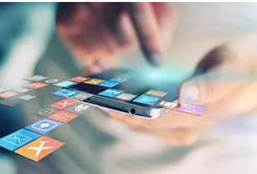
Internet Marketing Fundamentals