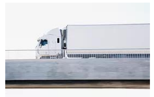
Supply Chain Management