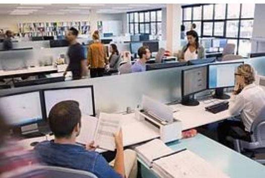
Contact Center Training