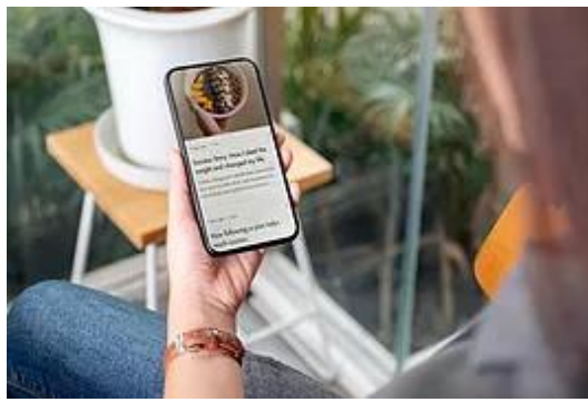
Health and Wellness at Work