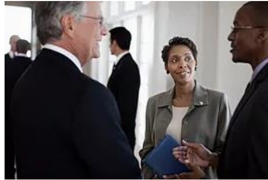
Developing Corporate Behavior