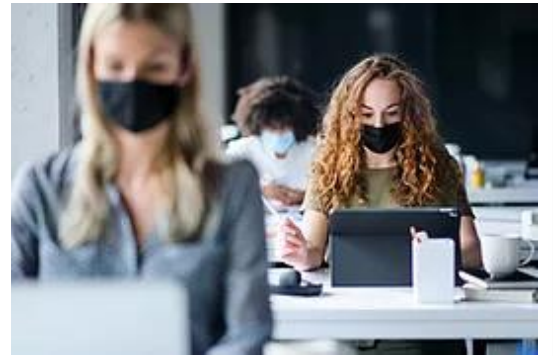
Office Health and Safety