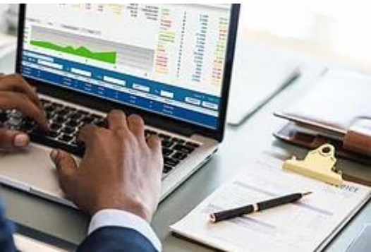
Budgets and Financial Reports