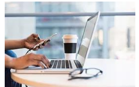
Executive and Personal Assistants