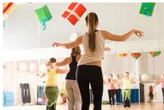
Adult Learning- Physical Skills