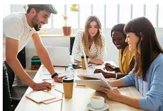
Team Building through Chemistry