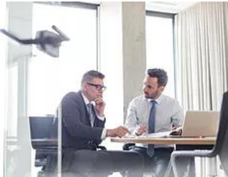
Business Succession Planning