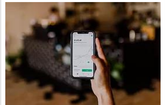
Managing Personal Finances