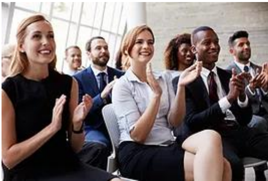
Motivating Your Sales Team