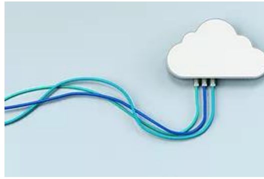
The Cloud and Business