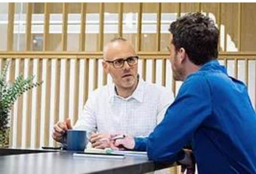
Body Language Basics