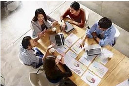
Civility in the Workplace