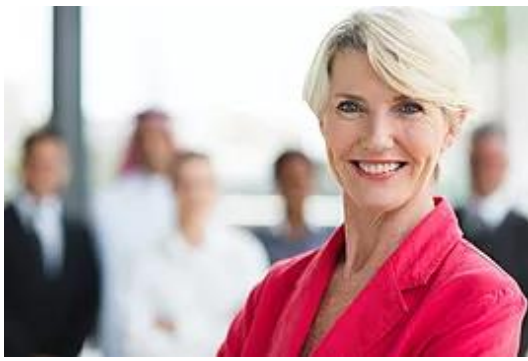
Being a Likeable Boss