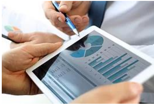
Measuring Results from Training