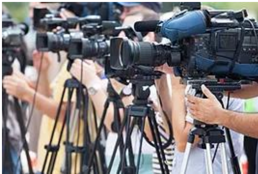
Media and Public Relations