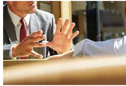
Overcoming Sales Objections