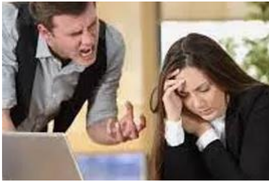
Managing Workplace Harassment