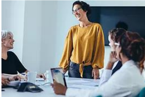
Accountability in the Workplace