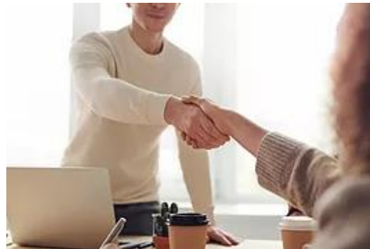
Respect in the Workplace