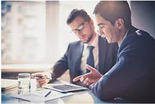
Delivering Constructive Criticism