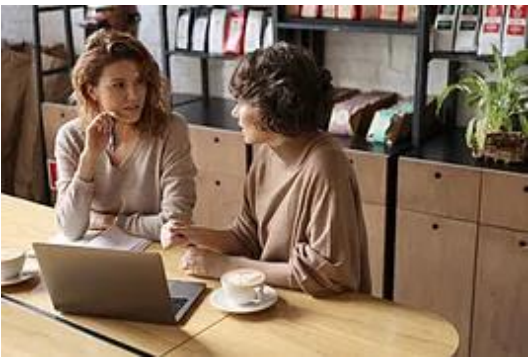
Coaching and Mentoring