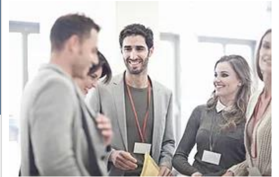
Networking Outside the Company