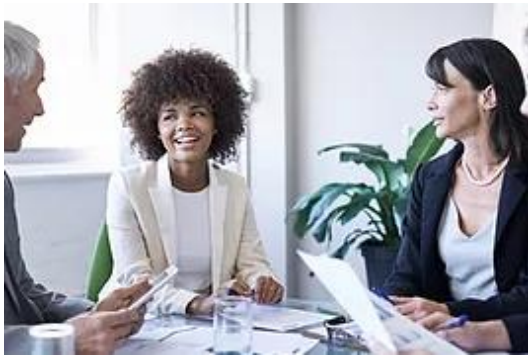
Ten Soft Skills You Need