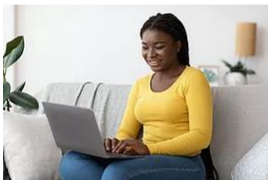
Telework and Telecommuting