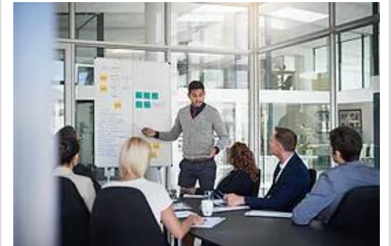
Developing a Lunch and Learn