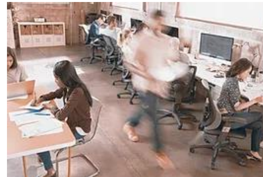
Responsibility in the Workplace