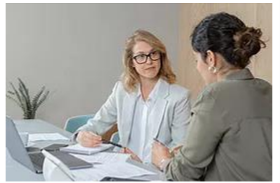
Human Resource Management