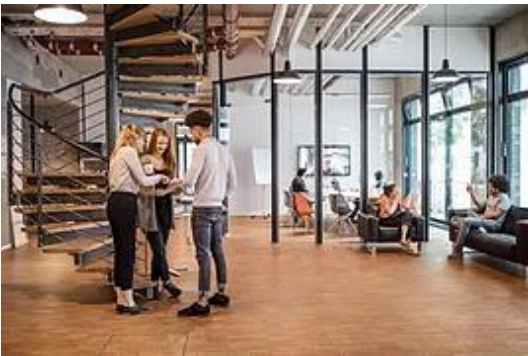
Office Politics for Managers