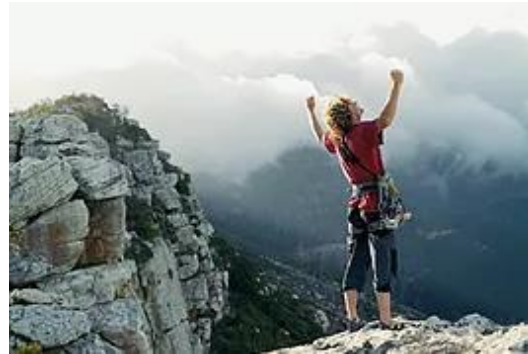
Goal Setting and Getting Things Done