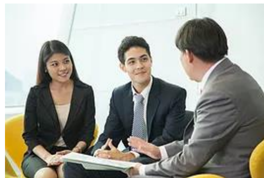
Top 10 Sales Secrets