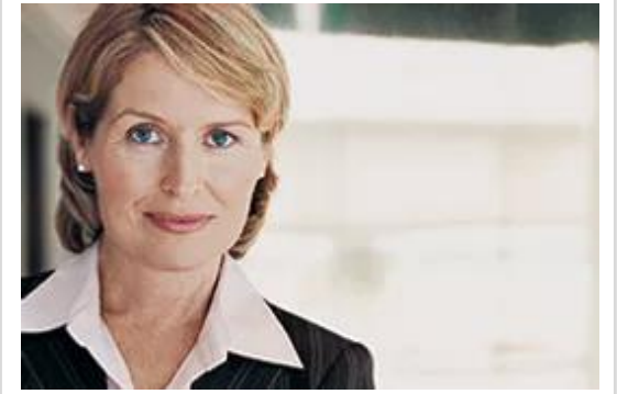
Women in Leadership