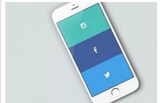
Social Media Marketing