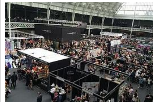
Trade Show Staff Training