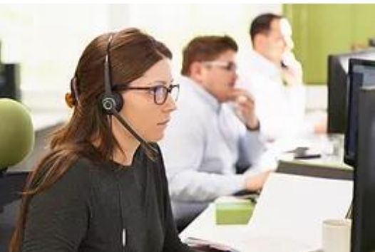
Call Center Training