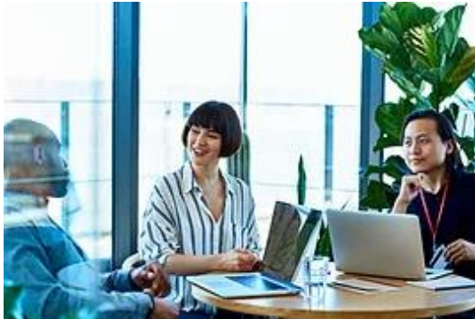
Emotional Intelligence in the Workplace