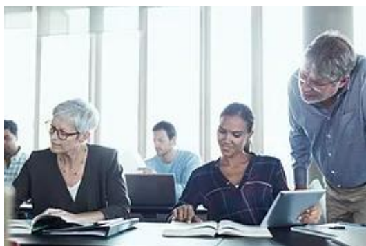
Adult Learning- Mental Skills