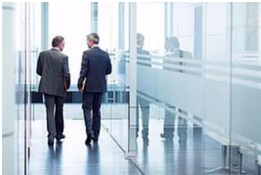
Networking within the Company