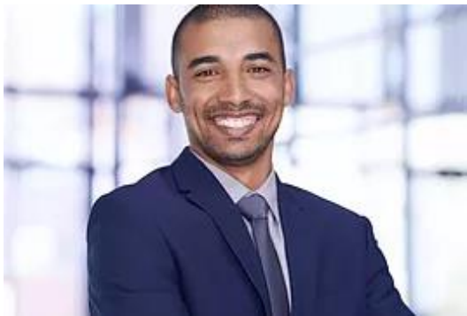
Leadership and Influence