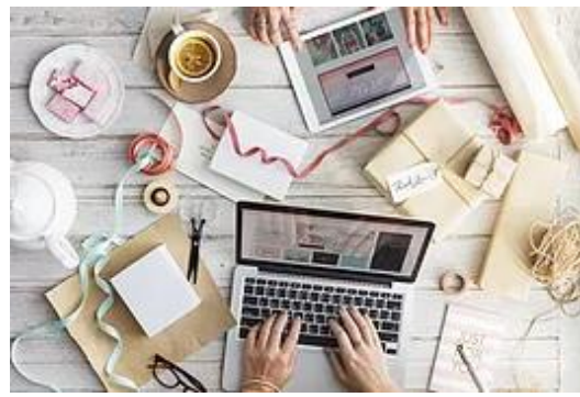
Creativity: Thinking Outside the Box