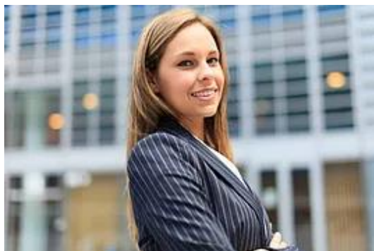
Assertiveness and Self Confidence