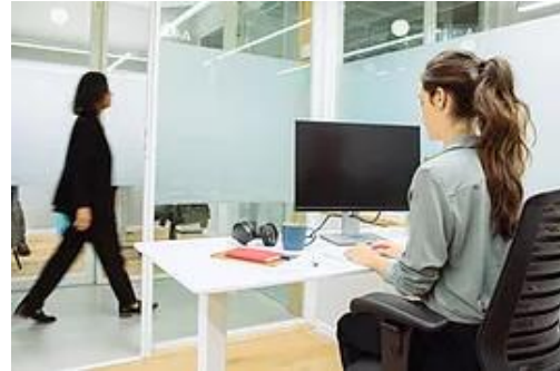
Administrative Office Procedures