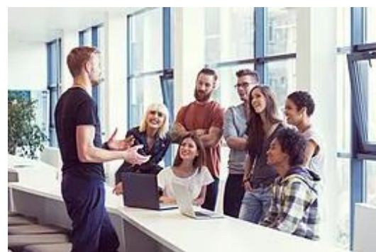
Team Building for Managers