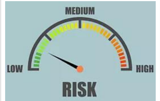
Risk Assessment and Management