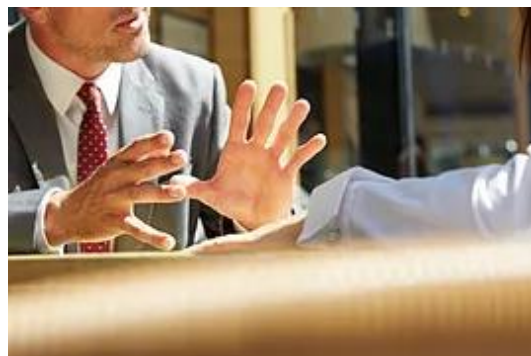
Creative Problem Solving