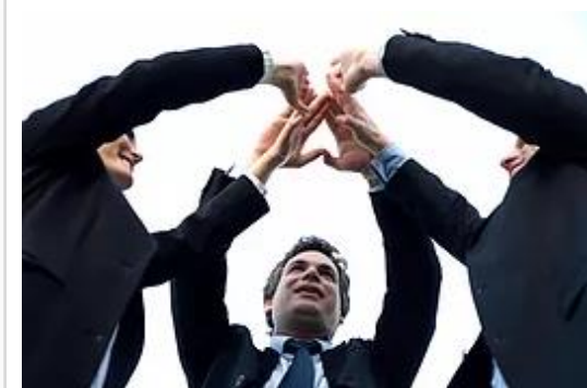
Teamwork and Team Building