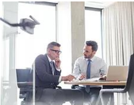
Conducting Annual Employee Reviews