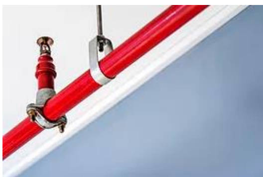
Safety in the Workplace