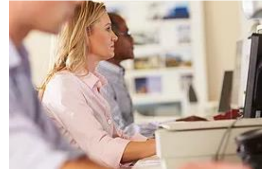
Archiving and Records Management