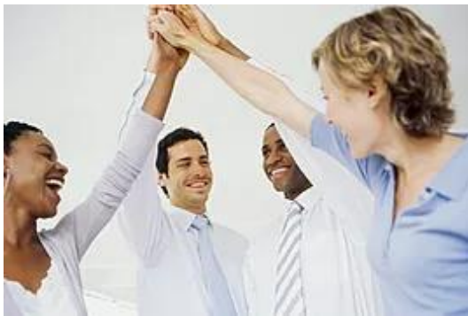
High Performance Teams Inside the Company