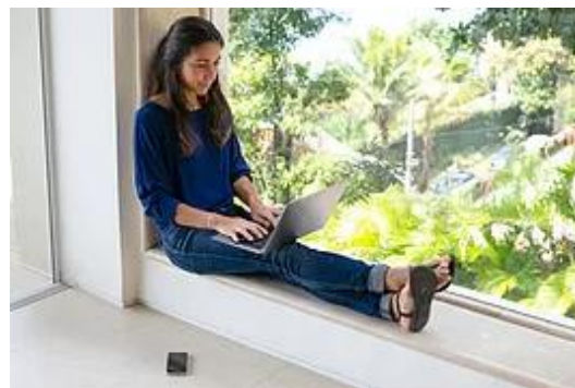
Job Search Skills