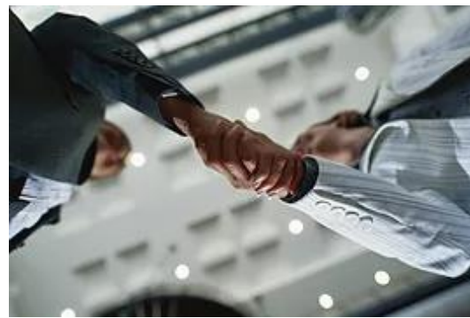
Trust Building and Resilience