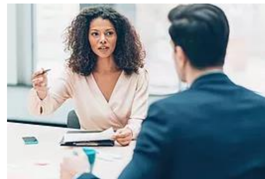
Life Coaching Essentials