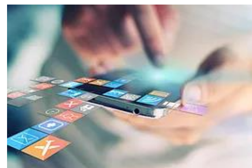
Social Media in the Workplace