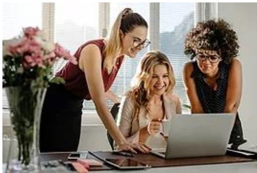
Creating a Great Webinar