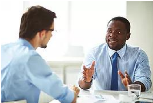
Developing New Managers